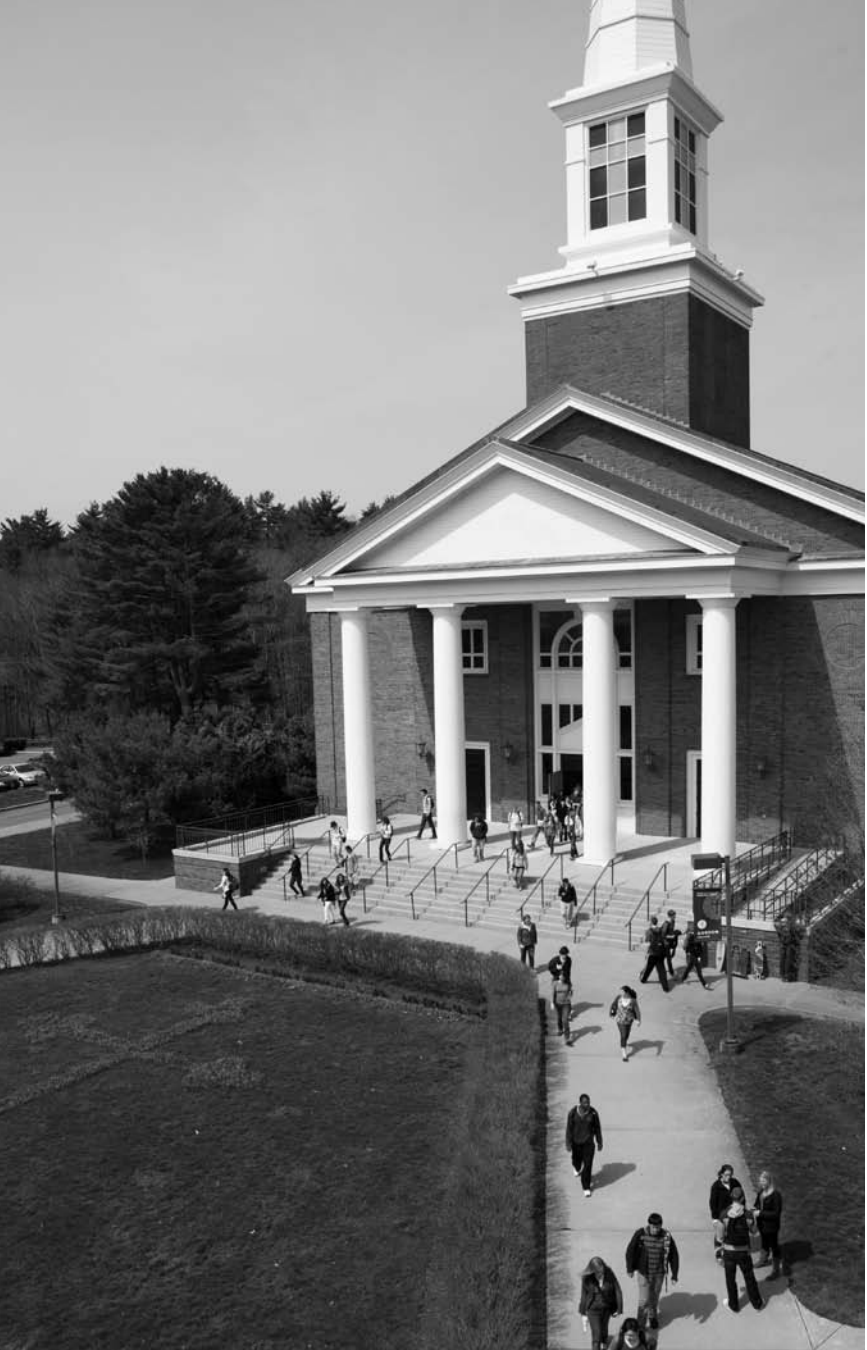
A. J. Gordon Memorial Chapel